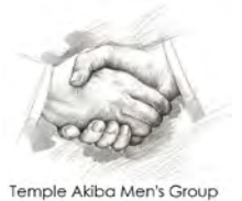
Temple Akiba Men's Group

It has been a wonderful year for the Men's Group. We have grown tremendously in membership, and this has allowed us to offer a great variety of events for Temple members, and to underwrite a number of Temple programs & activities.